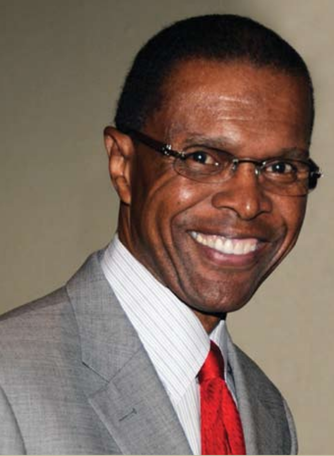
Gale Sayers, 2009 Humanitarian of the Year Honoree.