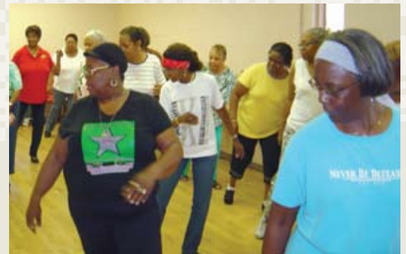
ALC launched the Healthy Behaviors and Lifestyle Program sponsored by AARP, including Market Shopping Tours, Line Dancing Classes, Computer Workshops, Yoga, and much more.