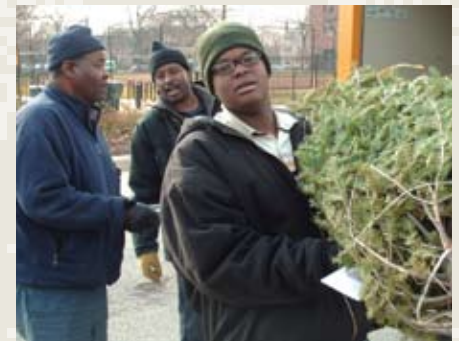
During the Annual Holiday Tree Give-away , Bronzeville residents received Christmas trees at the ALC headquarters facility on December 5, 2009.