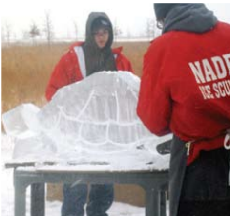
ALC's Polar Adventure outing showcased dramatic ice sculptures and much more.