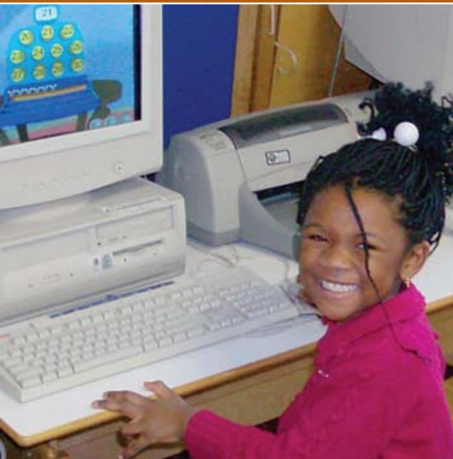
Pre-K student receives progressive computerized lessons.

CONTINUED FROM PAGE 1 ALC Meets the Needs of Changing Community