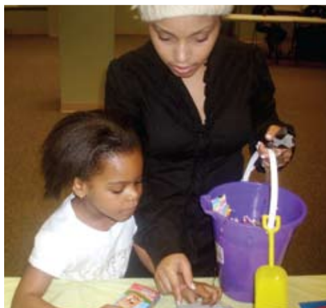
Kids and adults enjoy Easter activities during Family Fun Nights in April.