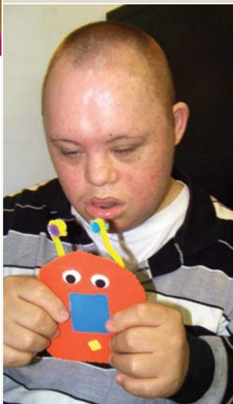
DD&BHS Consumer makes a picture-magnet for a Mother's Day gift.

Providing quality care is a continued priority for the Developmental Disabilities and Behavioral Health Services Department (DD&BHS) at the Abraham Lincoln Centre. Our consumers depend on us to deliver care that is not only first-rate, but also progressive and compliant with the latest State regulations. The dedicated team of administrators and care-givers provide that, and more, through ongoing staff training, consumer involved advocacy and interactive development activities.