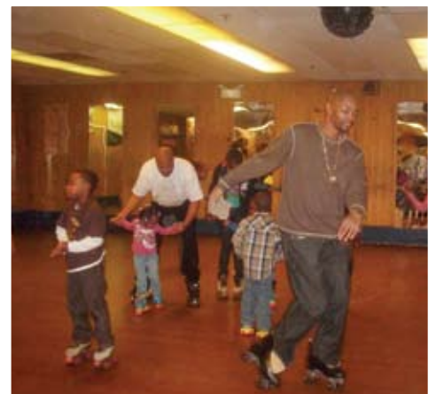
Roller Skating outing was a great way to exercise while having fun.