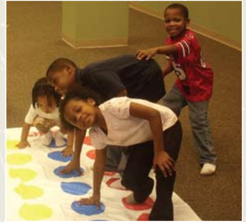
Family Fun Nights in May provide games and more for Bronzeville residents.