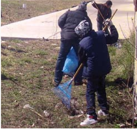
Neighborhood residents clean-up a local playlot during Green & Clean Day.