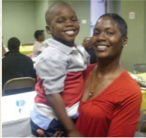
Mothers, Grandmothers and Aunts are honored by children during Mother's Day Brunch.