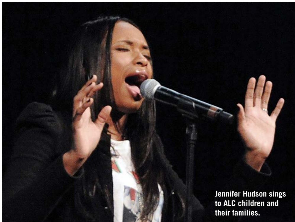
Jennifer Hudson sings to ALC children and their families.