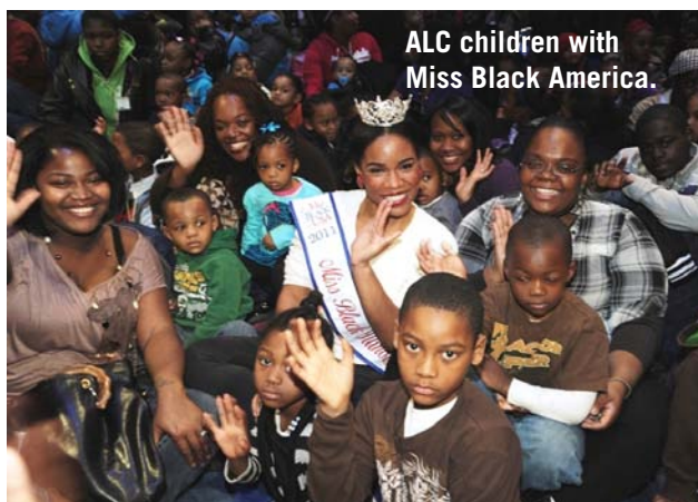
ALC children with Miss Black America.

We are excited to announce the launch of the new ALC Web site. Enhanced features include easier access to program details and donor opportunities; a comprehensive calendar of Centre events; plus a fresh look and feel that is focused on servicing our communities. We invite you to visit the new Web site www.abelink.org today.